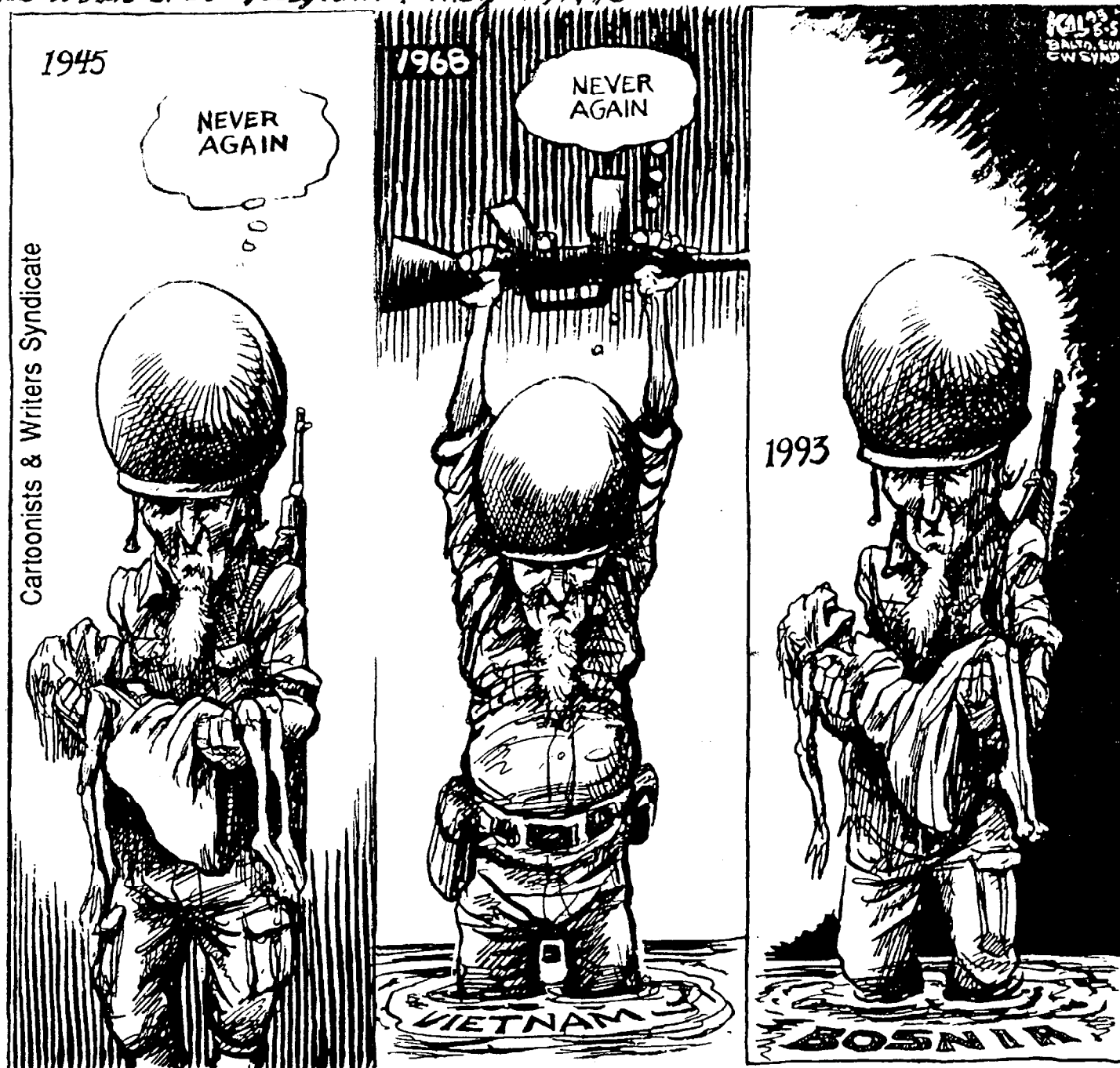
Cartoonists & Writers Syndicate