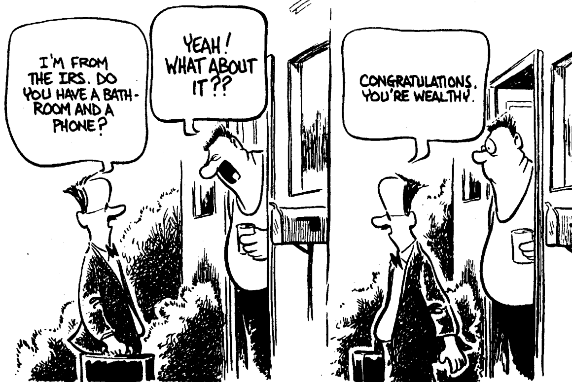
Chan Lowe Fort Lauderdale News/Sun-Sentinel Tribune Media Services