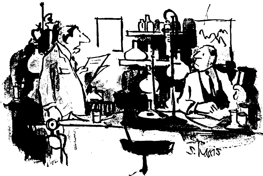
“The codeine is O.K., and the phenobarbitol is O.K., but the Food and Drug Administration says no to powdered bat's tooth.”