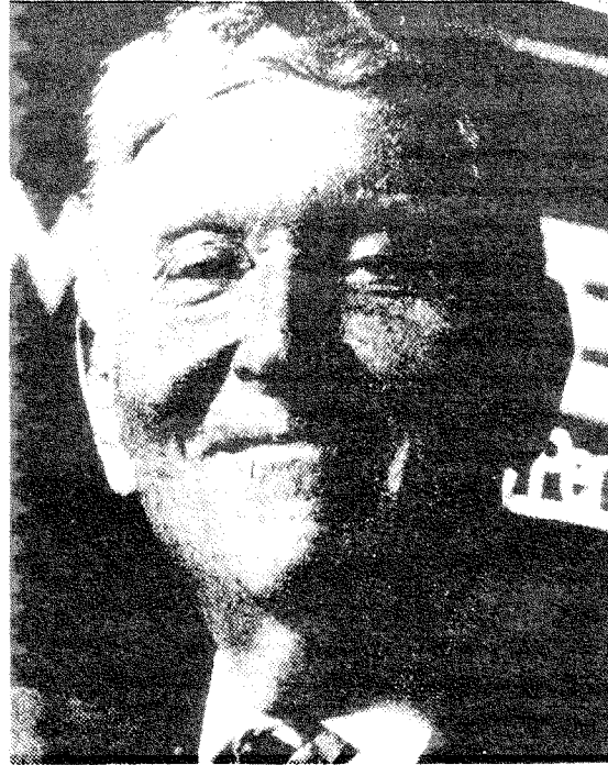
Media Boss Sumner Redstone: Television

In only 54 cities in America are there more than one daily newspaper, and competition is frequently nominal even among them, as between morning and afternoon editions under the same ownership. Examples of this are the Huntsville, Alabama, morning News and afternoon Times ; the Birmingham, Alabama, morning Post Herald and afternoon News ; the Mobile, Alabama, morning Register and afternoon Press ; the Springfield, Massachusetts, morning Union , afternoon News , and Sunday-only Republican ; the Syracuse, New York, morning Post-Standard and afternoon Herald-Journal —all owned