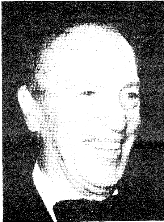
Media Boss Leonard Goldenson: Television

The control of the opinion-molding media is monolithic. All of the controlled media—television, radio, newspapers, magazines, books, motion pictures—speak with a single voice,