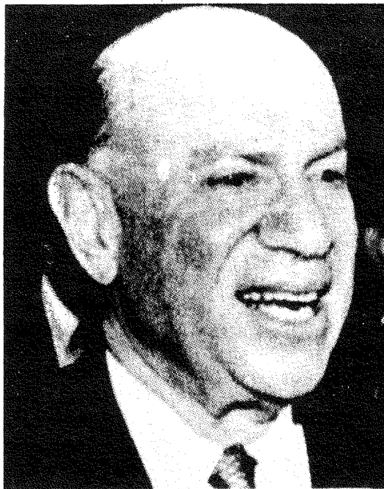
Media Boss Laurence Tisch: Television

CBS was under the domination of William S. Paley for more than half a century. The son of immigrant Jews from Russia, Paley left the family cigar business in 1928, when he was 27, to buy United Independent Broadcasters for $500,000. He renamed it Columbia Broadcasting System and made himself president. He became chairman of the board in 1946 and held that post until his partial retirement in 1983.