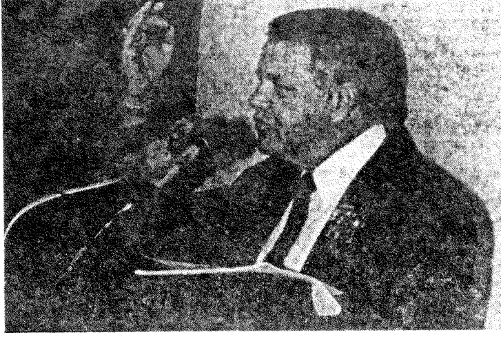
Bo Gritz addresses 35th Anniversary Liberty Lobby Board of Policy Conference.

about 30 to 40 flights every month. That's almost one a day. These planes were flying in from Bogota with Medellin cartel cocaine that was being distributed directly into the United States.