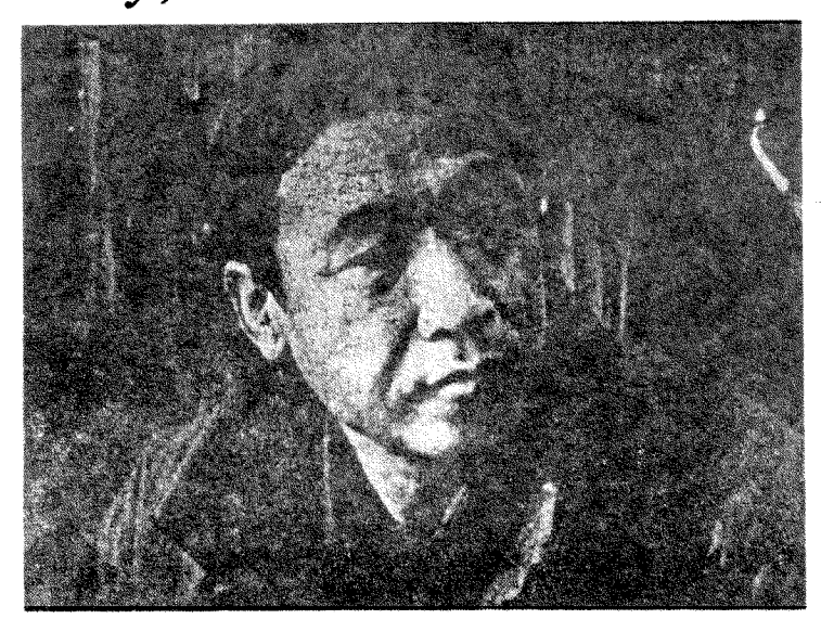
Drug Lord Khun Sa offered to cut off heroin to the United States. His offer was refused.

intercepted, according to the government, about 1,000 pounds of that.