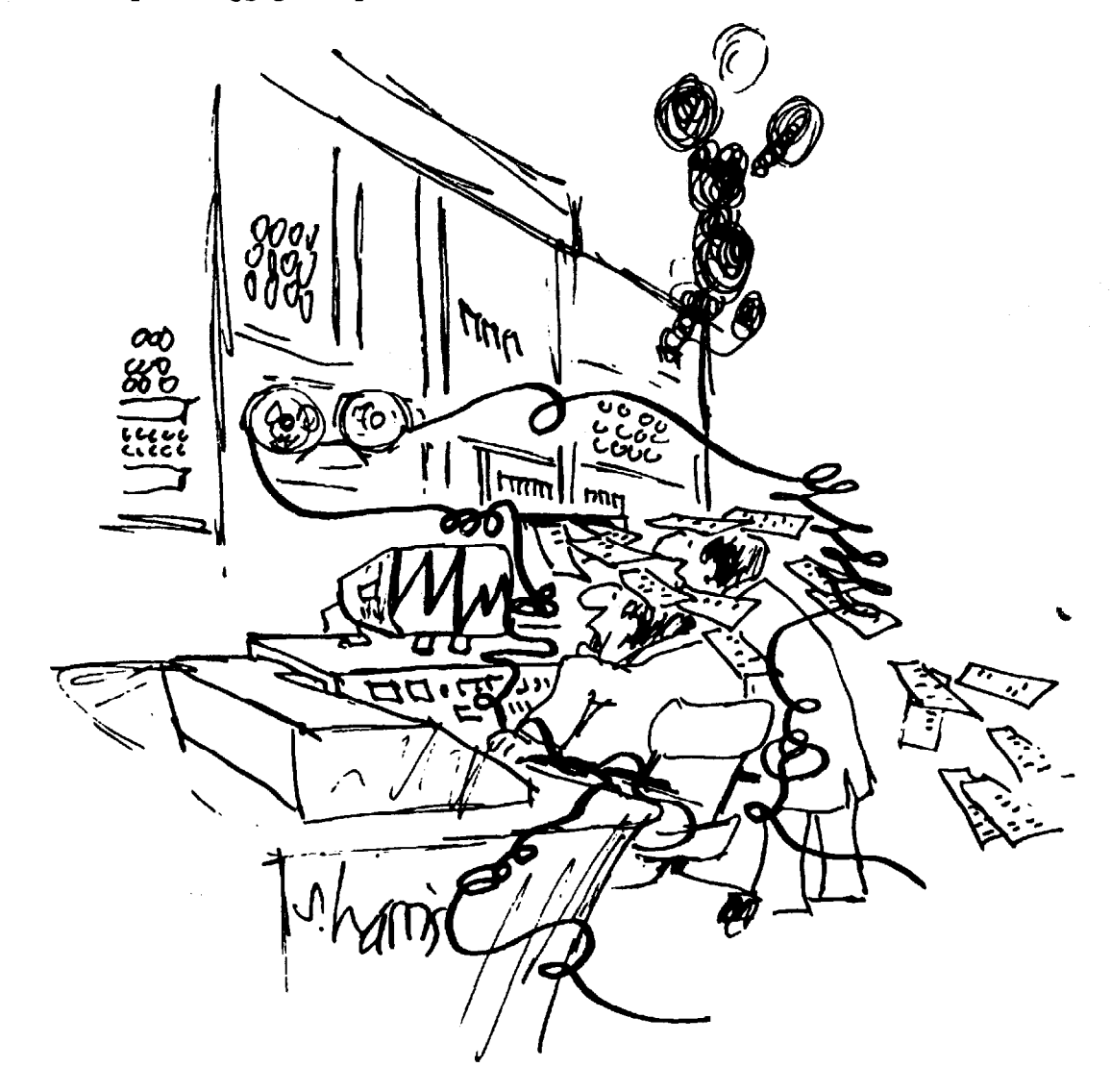
"We programmed it to simulate living conditions in the year 2000, and it's become hysterical."