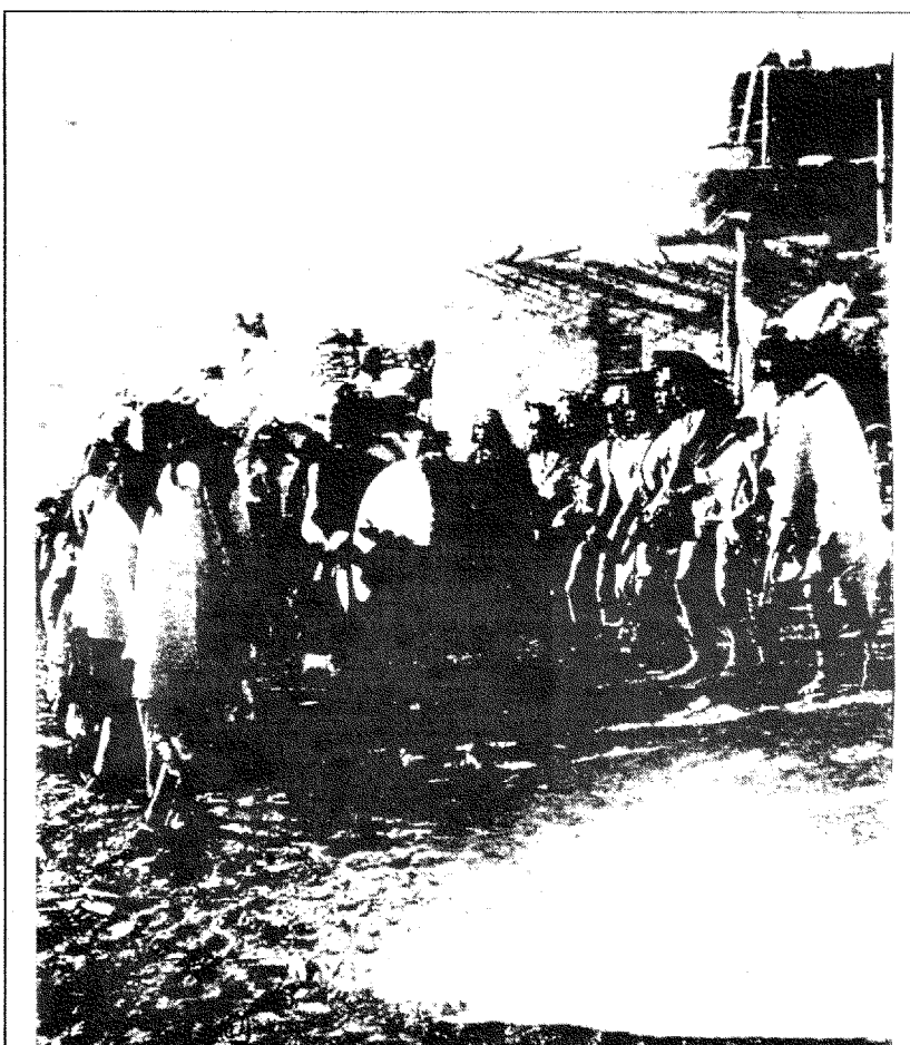
A public dance in the Wuuwuchim Ceremony, the 16-day ritual that begins the Hopi ceremonial year in November (negative 1539).