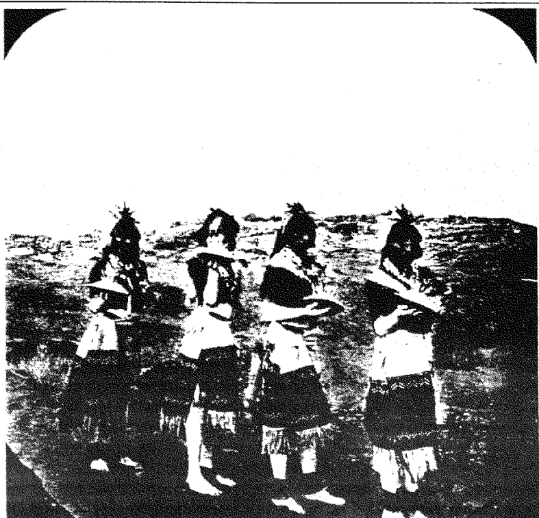
Hopi priests carrying cornmeal to Flute Spring as part of the Soyal or winter solstice ceremony (slide 51).