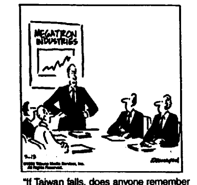
"If Taiwan fails, does anyone remember how to manufacture anything?"