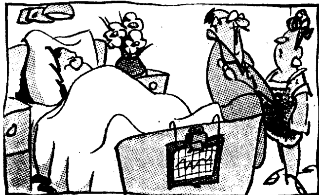
"We'd like to keep him for observation of his insurance."

Offered through New Gaia Products 800-639-4242