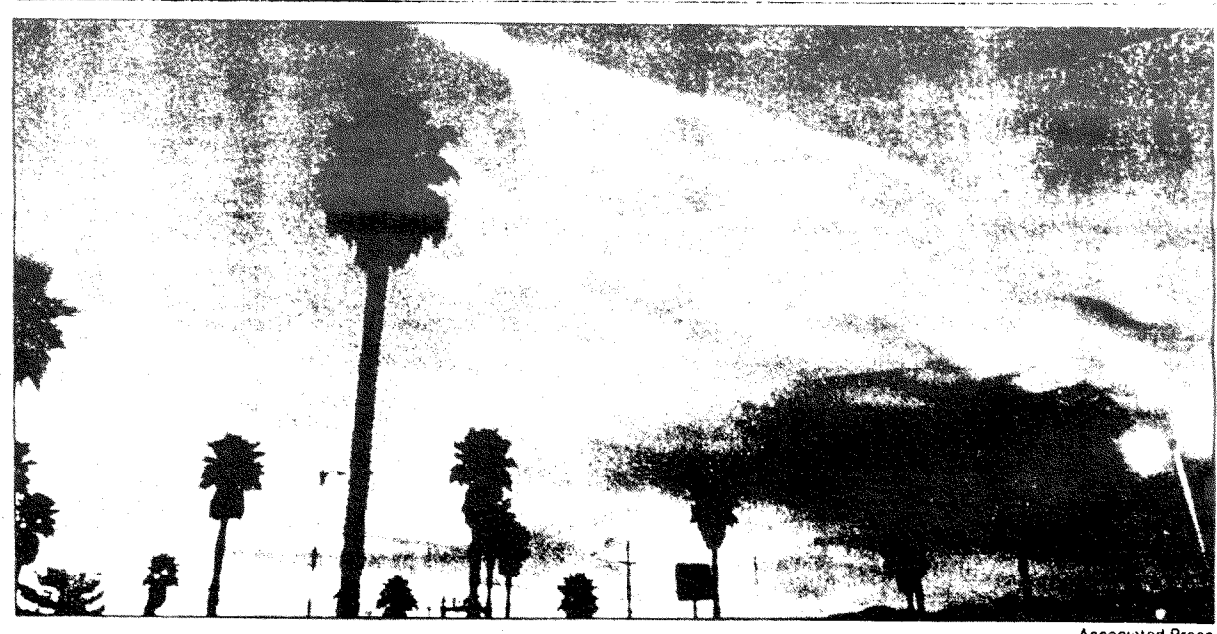
A contrains left by a rocket, carrying an SDI satellite, that was launched from Vandenberg Air Force Base.

10 - NEWS / SUNDAY, NOVEMBER 22, 1992 / DAILY NEWS