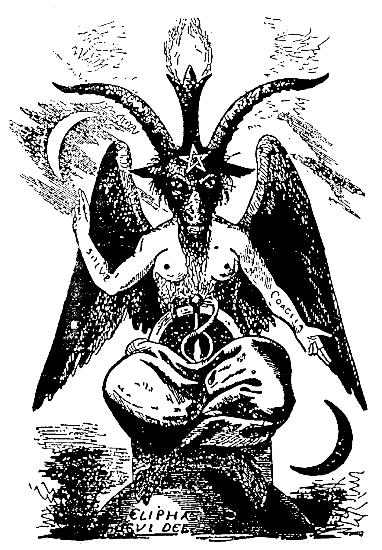
From Levi's Transcendental Magic.